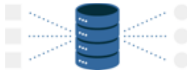
eReceipt service provider -present eReceipt - archive and re- routing