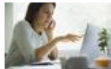
4. Usage of eReceipts