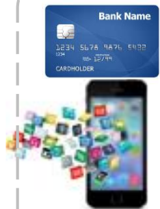
eAddress and payment method